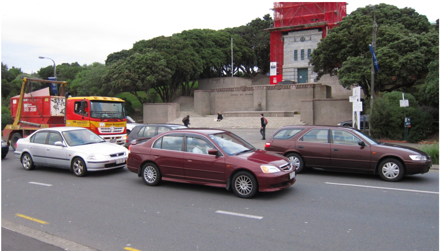
Photo B of the Current National War Memorial Park