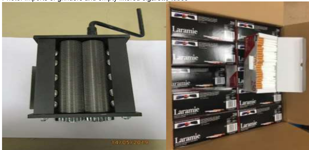
Photo: Imports of grinders and empty filtered cigarette tubes

Customs is also seeing legal imports of grinders, liquids and empty filtered cigarette tubes which are likely used to turn the leaf into smokable tobacco and cigarettes.