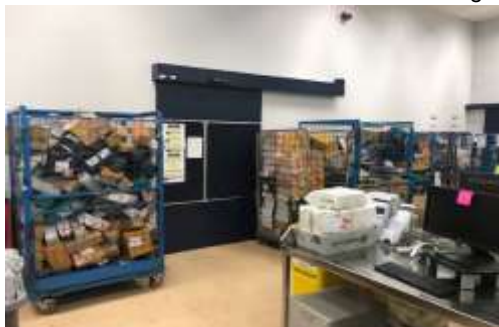
Photo: some of the 2086 packages of cigarettes intercepted over two weeks at the International Mail Centre in August 2019