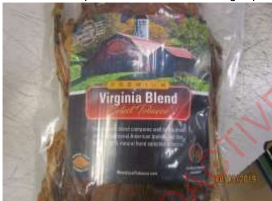
Photo: An example of the tobacco leaf being imported

Customs is also seeing legal imports of grinders, liquids and empty filtered cigarette tubes which are likely used to turn the leaf into smokable tobacco and cigarettes.